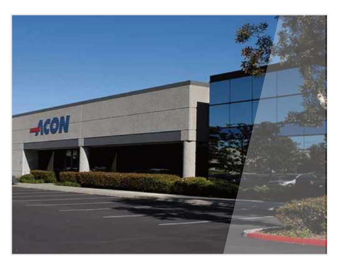
San Diego, California USA

ACON Laboratories, a global, award winning manufacturer with its headquarters in San Diego, has proudly built its reputation in the medical device industry as a strategic partner and OEM manufacturer for some of the largest companies worldwide. At the core of the organization resides the adage, "Your Trusted Partner." The company's goal is to make a positive health impact on the millions of people around the world that use its products.