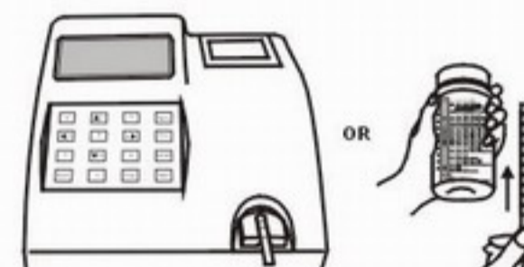
Step 3: Obtain results by analyzer or visual reading